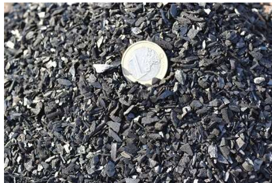
Picuture 1: Biochar fraction size